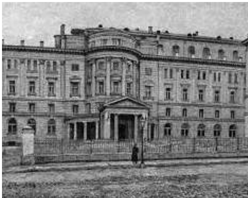
THE MOSCOW CONSERVATORY, C. 1901