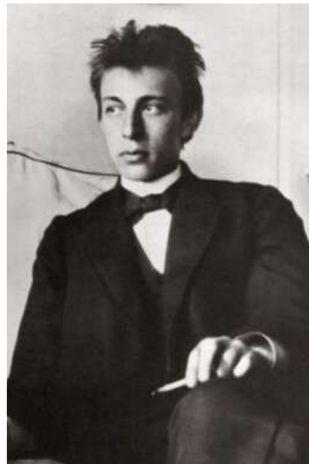
SERGEI RACHMANINOFF AS A STUDENT

The virtuoso is expected to give his best... and look to the students of the world to do their share in the education of the great musical public.