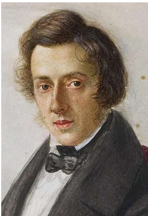
FRÉDÉRIC CHOPIN (1810 - 1849)

This is interesting, of course, and may help to stimulate a dull imagination. However, I am convinced that it would be far better for the student to depend more upon his real musical understanding. It is a mistake to suppose that the knowledge of the fact that Schubert was inspired by a certain poem, or that Chopin was inspired by a certain legend, could ever make up for a lack of the real essentials leading to good pianoforte playing.