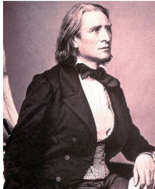
FRANZ LISZT (1811 - 1886)

This is the reason for their gigantic musical prominence.